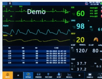
NIBP list interface