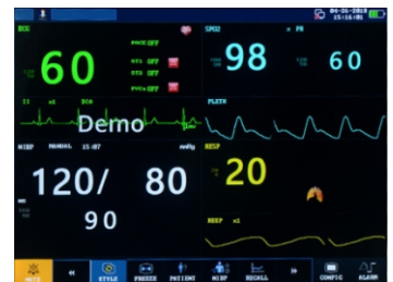
Big font interface